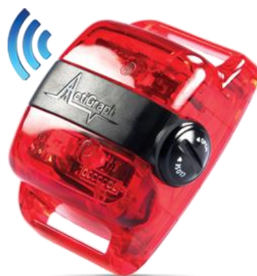
Fig 1. Sensor Actigraph (WGT3X)

ActiGraph WGT3X – Accelerometr it is a wireless device having software for analysis and objective physical activity data analysis tools can be configured to achieve specific research. ActiGraph provides objective information for 24 hours (physical activity and sleep). In addition, information is available on energy expenditure, body position and the amount of sleep, light sensor provides valuable information about the environment, measure your pulse, blood pressure, and is fully compatible with other devices ActiGraph .