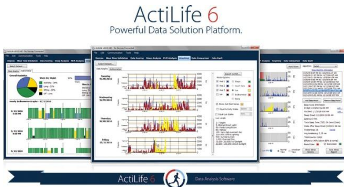
Fig 2. Software to collect and analyze data Actigraph