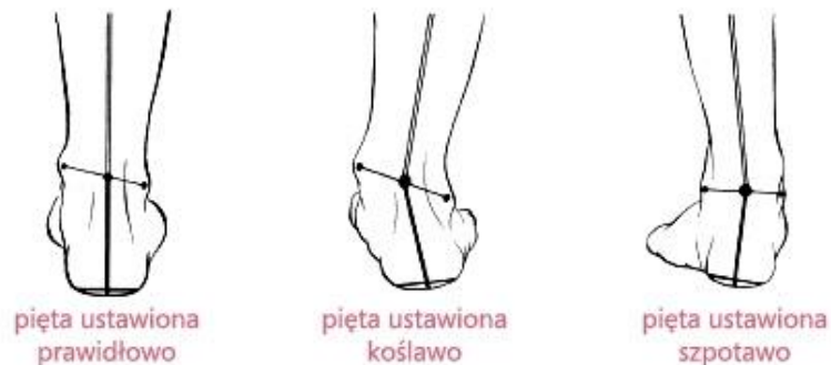
Figure 3. Postural defects of the feet.