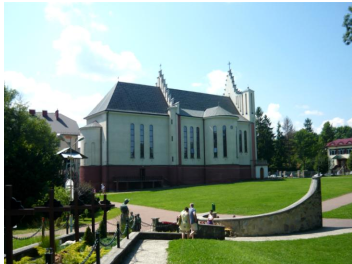
Fig. 5. The Sanctuary of Our Lady of La Salette in Debowiec

Potential tourism Jaslo land this are also a places of worship. The most important is Sanctuary of Our Lady of La Salette in Debowiec called Polish La Salette (Fig. 5).