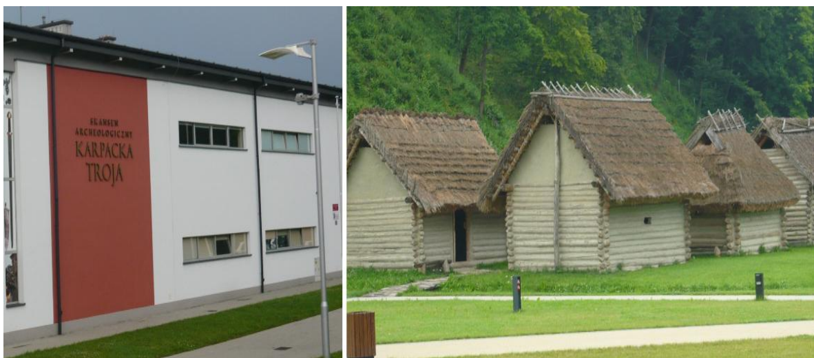
Fig. 4. Archaeological Open Air Museum Trzcinnica - Carpathian Troy, photo: Kamila Płazińska

In addition to the potential of the natural values, is worth mentioning also about anthropogenic values of the district. Potential tourism of the district Jaslo began to shape although unknowingly already in the Paleolithic era. Evidenced by the archaeological finds. The beginnings of life on the area date back to the Neolithic (4500 - 1800 BC) which is confirmed by archaeologists who find stone hatchets and small ax, which served the then inhabitants.