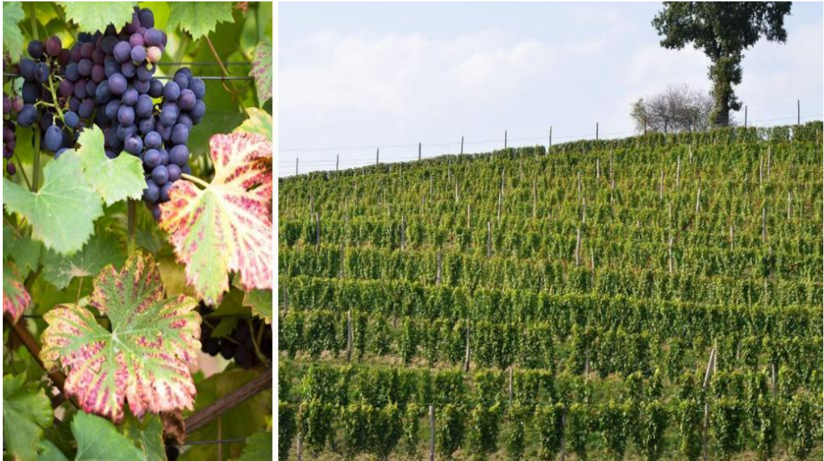
Fig. 3. Vineyard Jasiel, photo: [7]

year are organized "International Days of Wine" in Jaslo, which are a very good way of promoting the city and the entire region. As is clear from the observations of the author, every year the number of guests at the event increases. These are largely residents of the southeastern part of Polish but also foreign guests.