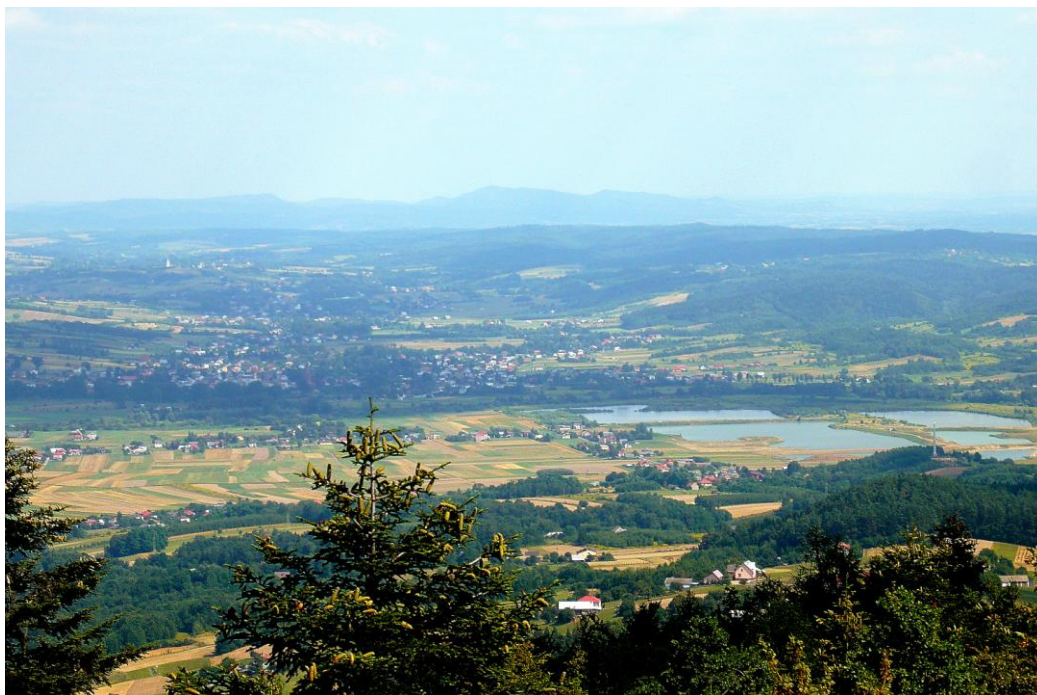
Fig. 2. View on Low Beskid from the top of Liwocz

The district area is diverse in terms of landforms. Areas in the north of the district are typically characterized upland formation, while the southern areas are mountainous terrain. In the south of the district extends Low Beskid with distinctive, green and mild hills. The highest peak in the district is Wątkowa (846 m), which is in the strip Magura Wątkowska. In the northern part of the district, is characteristic the top hill Liwocz (562 m), overlooking a panorama of the very remote of areas (Fig. 2). On clear days you can see the Bieszczady, Tatry, Gorce, Babia Góra and the Świętokrzyskie Mountains, which seems to be very attractive to tourists. In view of the geological flysch structure, are on the study area numerous outcrops sullied, often protected eg. : reserve "Kornuty".