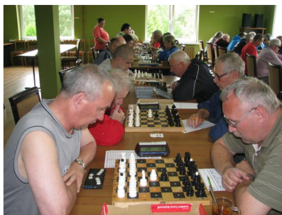
Photo 3. Chess Tournament for "Podkarpacie Cup" 2015.

Chess section was established along with draughts section in 1991. Its first leader was Franciszek Mazur. The board for the blind is significantly different than commonly used board. Black squares are convex, the figures have sharp edges and white squares are concaved. The figures are put in the holes in the squares, which prevents them from accidental moving. The players use Braille to read figures' layout by the use of players' hands. Chess in Przemyśl have a long tradition as the first team chess championship took place as soon as 1956 with a transitive cup of Polish Association of the Blind's (PZN) Board being the reward 37 . Every year the players in the section take part in Polish Team Championship of Voivodeship's Spartakiade of the Blind for "Podkarpacie Cup", All-Poland Chess Tournament for the Blind and Visually Impaired for Przemyśl Area Cup, Voivodeship's Spartakiade for the Blind, All-Poland Chess Tournament for "Podkarpacie Cup", many times gaining high places during the competitions 38 .