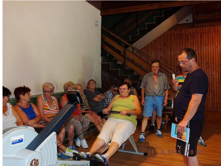
Photo 6. Classes of indoor rowing section.

Biathlon section started its first trainings in the winter of 2014/2015. The section's leader is Kazimierz Cetnarski. Biathlon is a new sport discipline trained by the blind and the visually impaired. Biathlon trainings and contests require special shooting positions. For the time being, in Poland there are two such positions produced by EcoAims company in Finland. They have a certificate of International Paralympic Committee (IPC).