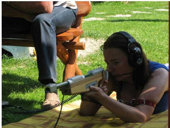
Photo 4. A member of the Club Barbara Rup during laser shooting contest, source: the archive of PKSiRNiS „Podkarpacie”.

In 2004 dancing section was created that existed until 2010.