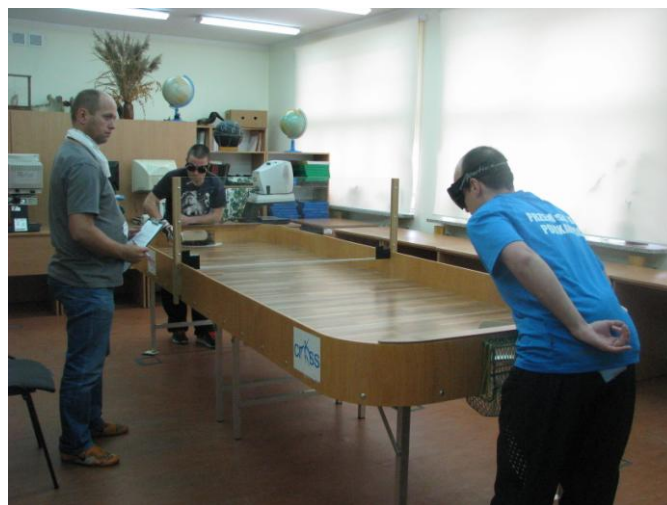
Photo 5. „Podkarpacie Cup” tournament – showdown, 2015.