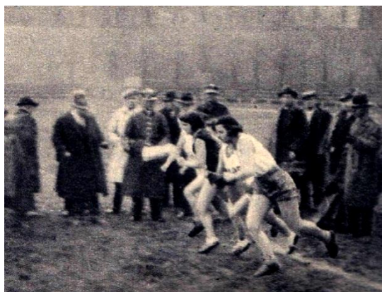
Fig. 5. 1933 start of the women's cross-country race for the championship of the Lviv OZLA

In 1933, on cross-country trails, no one was surprised by the presence of female runners. Women shyly and rarely appeared on cross-country trails, among others in Lviv on March 26, 6 competitors competed on the distance of 1 000 m, which won "Dzidka" "Lechia" Lviv – 5.26,0 min. 2 "Iza" Lechia Lviv 96 .