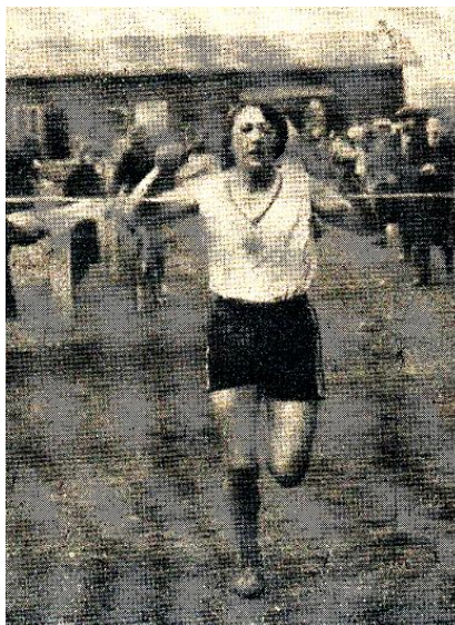
Fig. 1. Victory of "Bronka" in women's cross-country race in Krakow