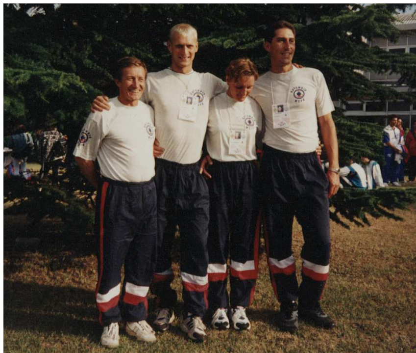
Fig. 6. National team Poland Valenciennes 1995 r.