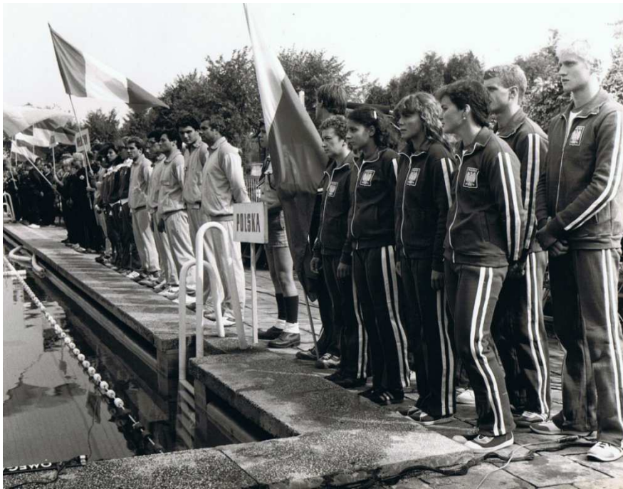
Fig. 1. Open World Championships in Warsaw. 1983