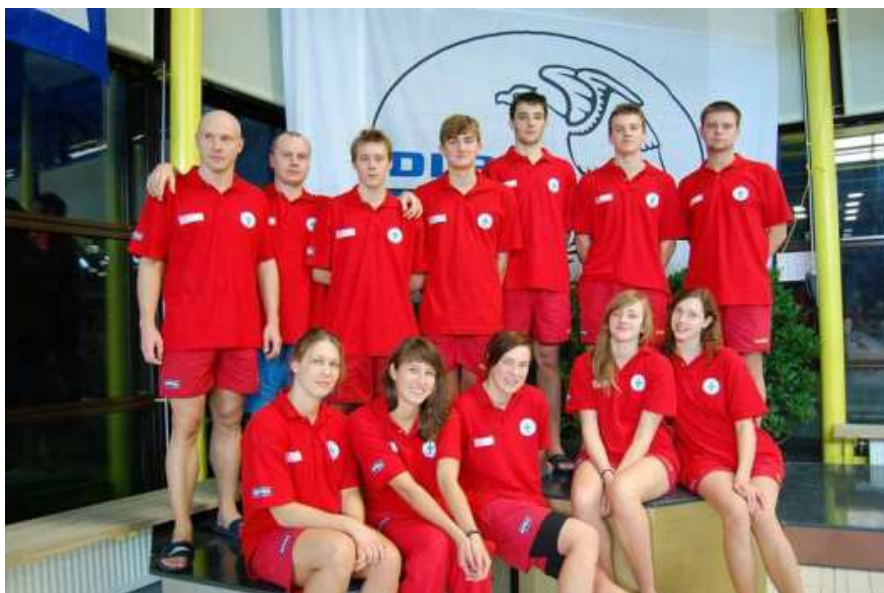
Fig. 9. National team Poland 2008 r.

In the team classification Poland took the 11th place.