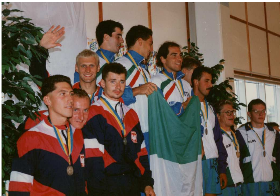
Fig. 5. Polish relay 4 x 25 m rescue dummy - silver medal Jöngköping 1991 r.